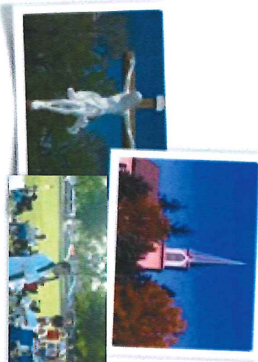
At St. Victoria Parish Family, we seek to reach out to all as the face and hands of Jesus Christ.